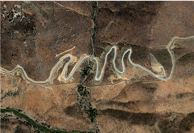
Best of Luck with the Wall Running time: 6 mins

Best of Luck with the Wall is a documentary short observing in striking detail the changing geography, geometries and the expansive, complex landscape that comprises the 2,000-mile long US-Mexico border. The film was made by cutting and collaging over 200,000 satellite images downloaded from Google Maps.