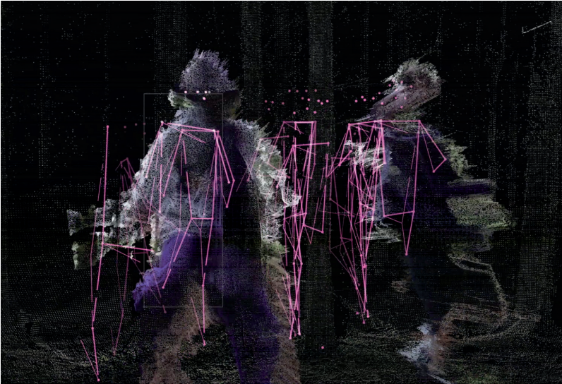
Choreographic Camouflage Running time: 4 mins

To demonstrate these tactics the music video has been shot with the same laser scanning technologies used by autonomous vehicles and is overlaid with machine vision visualizations of the way skeleton detection algorithms are trying to read and recognize the body. Fashion and music have always developed in response to existing power structures. The animated film prototypes a sub-cultural movement that may soon emerge in response to imminent smart city technologies.